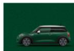
British Racing Green