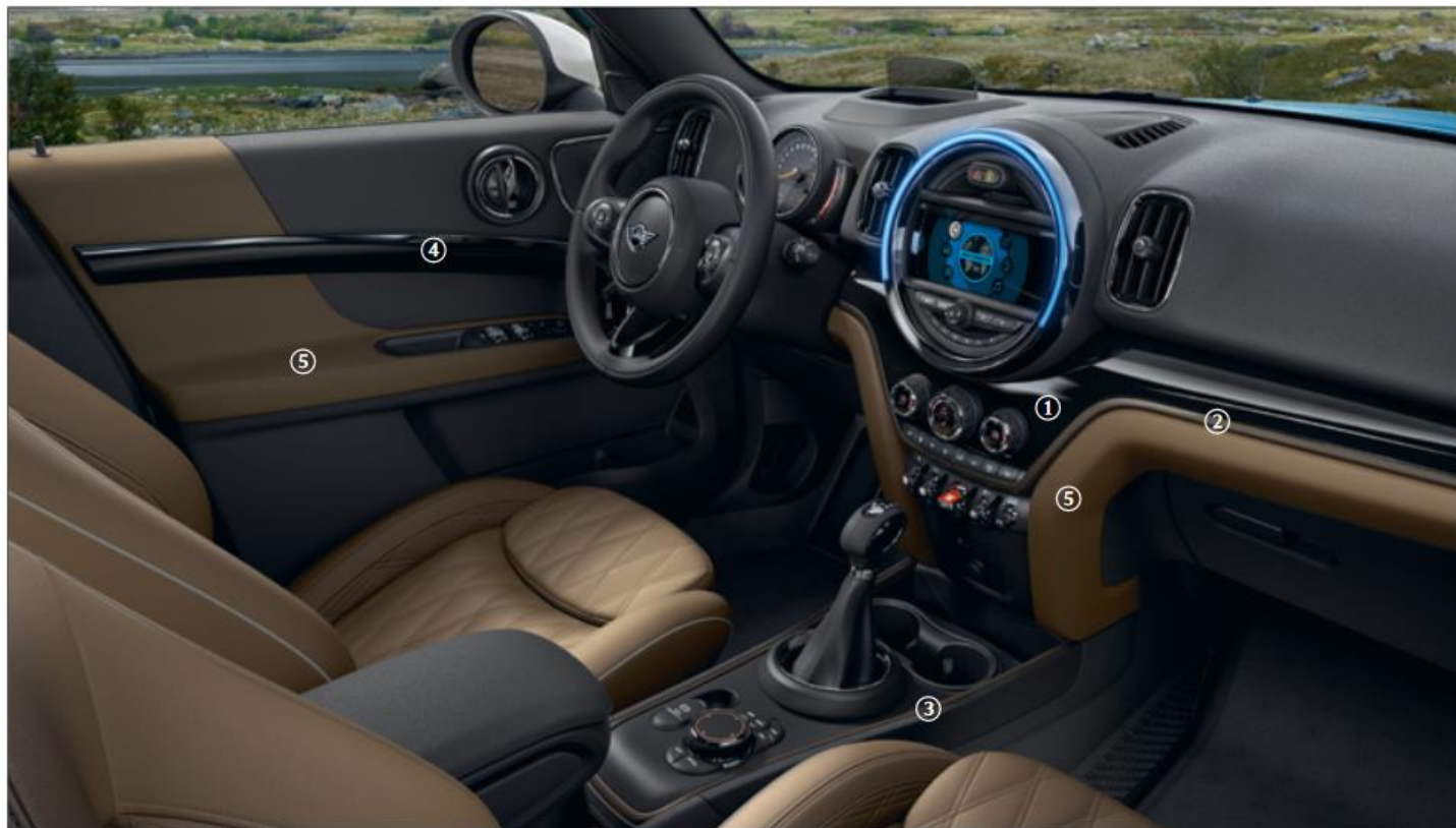
Interior Panel Piano Black (4BD)