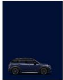
MINI Yours Lapisluxury Blue