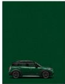
British Racing Green