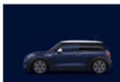
MINI Yours Lapisluxury Blue